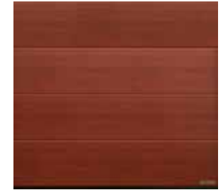
18 Rusty Oak