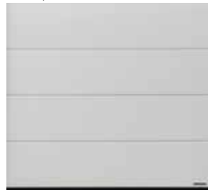
31 White Brushed