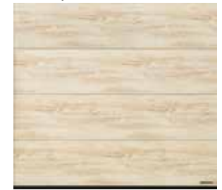
28 Weathered Look