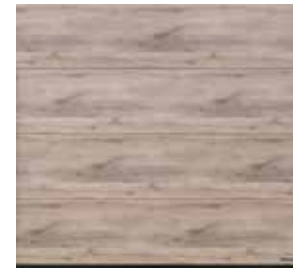
33 White Oiled Oak