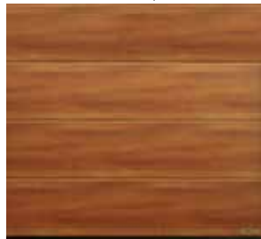
30 Colonial Walnut