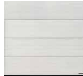
32 White Oak