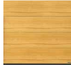
15 Nature Oak