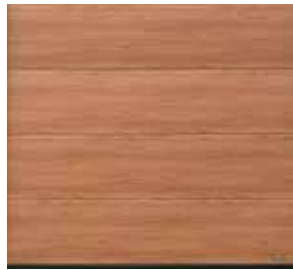
20 Noce Sorrento, plain