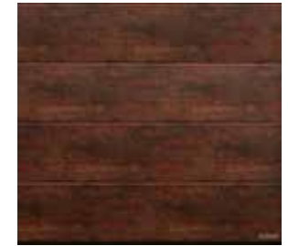
10 Rusty Steel