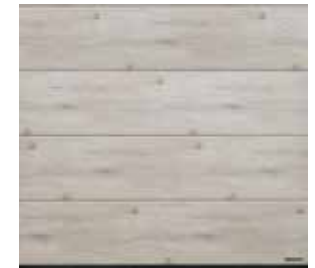
34 Whitewashed Oak