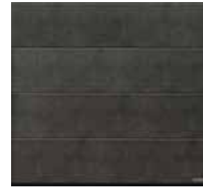
9 Grigio Scuro