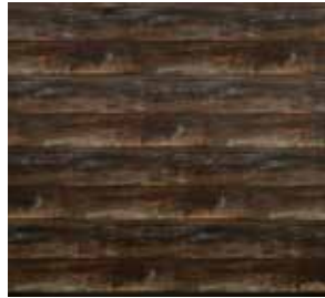
13 Burned Oak