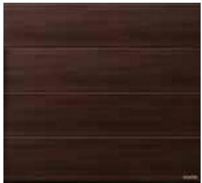
28 Terra Walnut