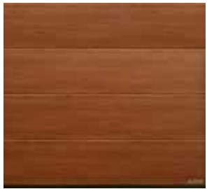
19 Noce Sorrento Balsamico